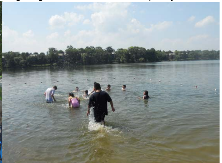
Inspired Youth at Lake Barrington